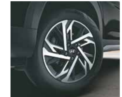
R17 (D=436.6 mm) Diamond cut alloys