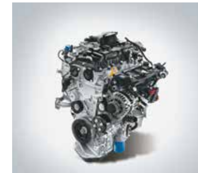
1.5l Petrol turbo [7DCT]