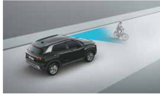
Forward Collision - Avoidance Assist - Cycle (FCA-Cyl)