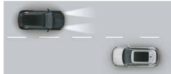
High Beam Assist (HBA)