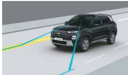
Lane Following Assist (LFA)