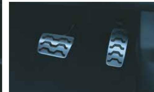
Sporty metal pedals