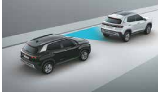
Forward Collision - Avoidance Assist - Car (FCA-Car) & Forward Collision Warning (FCW)