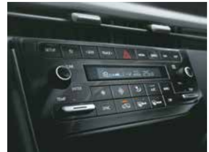
Dual zone automatic temperature control (DATC)