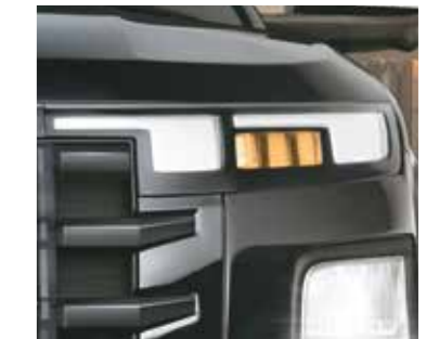
Front turn signal with sequential function

Other features: Puddle lamp with welcome function | Chrome outside door handles | Front & rear skid plate Integrated rear spoiler with LED HMSL (high mounted stop lamp)