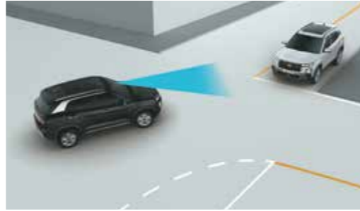
Forward Collision - Avoidance Assist - Junction Turning (FCA-JT)