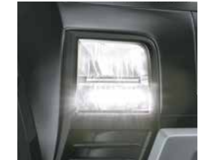
Quad beam LED headlamps