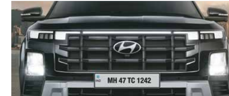
Black chrome parametric radiator grille

Bold. Charismatic. Extraordinary. Hyundai CRETA is symbolic of all things impressive no matter how you look at it. Its black chrome parametric grille makes a striking impression. Its horizon LED positioning lamp & DRLs and quad beam LED headlamps in the front give the SUV an unmistakable presence on the road. The rear profile is also sculpted with refreshingly elements like the connecting LED tail lamps that announce its departure.