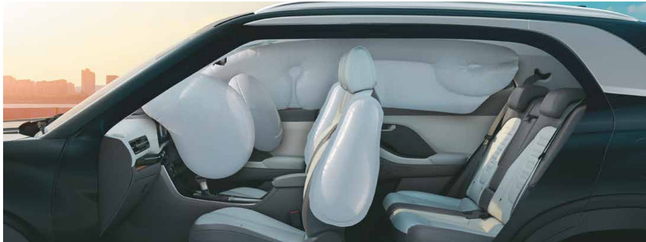
6 Airbags standard