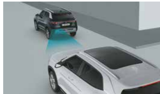
Safe Exit Warning (SEW)