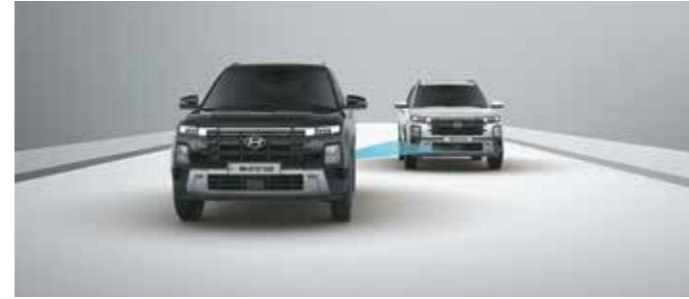
Blind-spot Collision - Avoidance Assist (BCA) & Blind-spot Collision Warning (BCW)