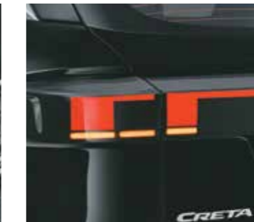
LED rear turn signal with sequential function