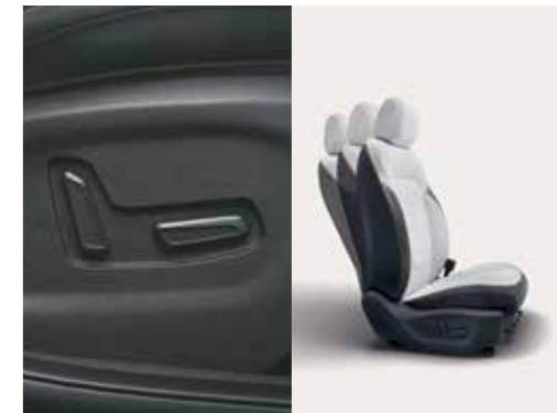
Power driver seat - 8 way

Other features: Driver rear view monitor | Front row ventilated seats | Voice enabled smart panoramic sunroof 60:40 split rear seat with 2-step recline | Rear wireless charger