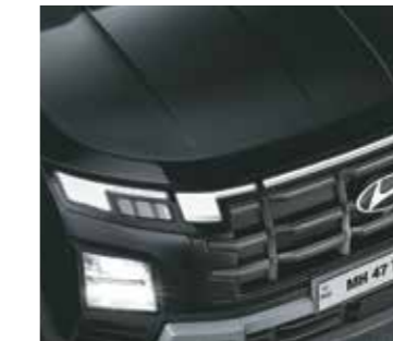
Horizon LED positioning lamps & DRLs