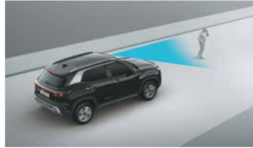
Forward Collision - Avoidance Assist - Pedestrian (FCA-Ped)