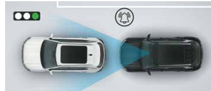
Leading Vehicle Departure Alert (LVDA)