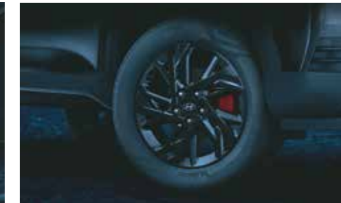
Black alloys with red calipers