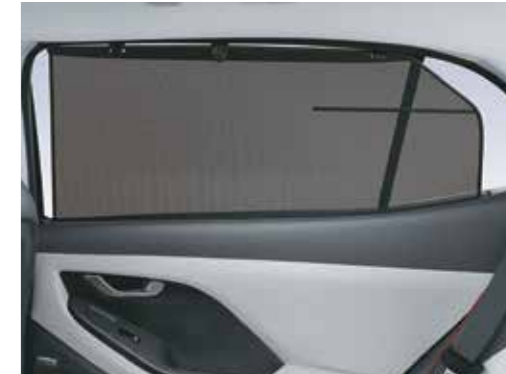
Rear window sunshade