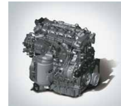
1.5l Diesel [6MT and 6AT]