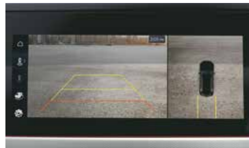
Surround view monitor (SVM)