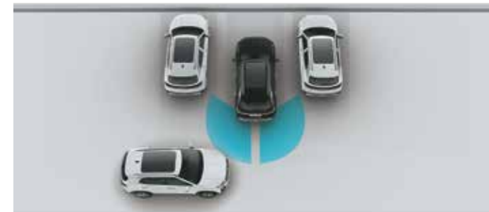
Rear Cross - Traffic Collision - Avoidance Assist (RCCA) & Rear Cross - Traffic Collision Warning (RCCW)