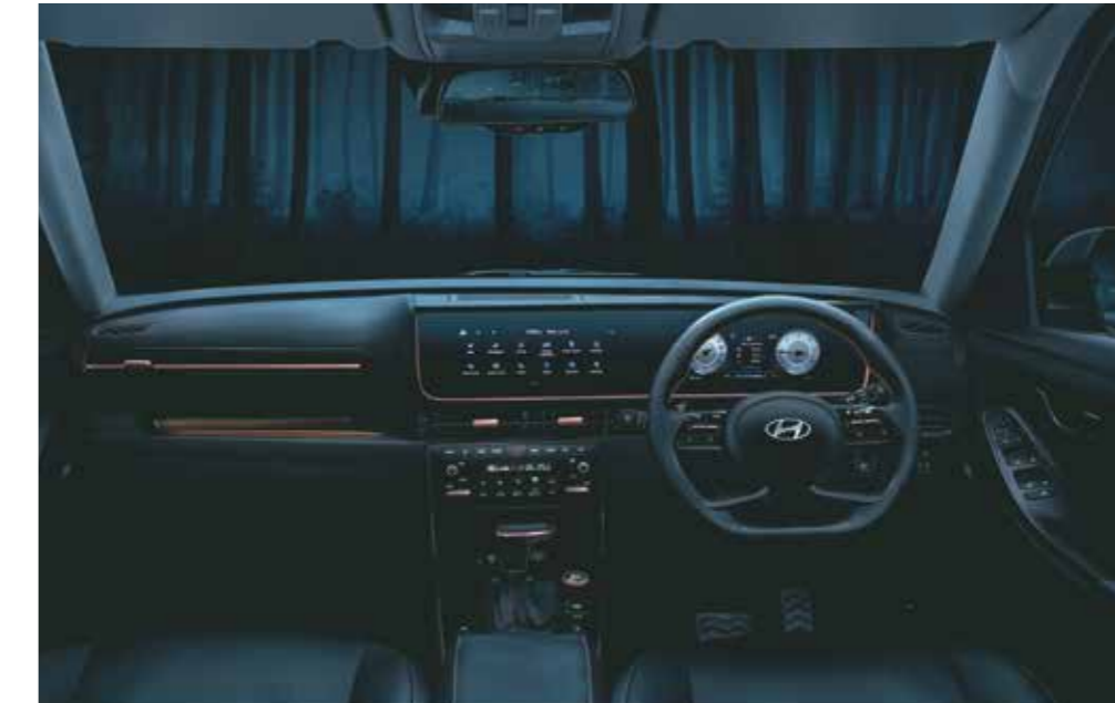
All black interiors with brass coloured inserts

If dark is your style, CRETA Knight will make you fall in love with it at the very first sight. Exuding great style and sophistication, it truly stands out with its all-black exteriors and an equally classy interiors with brass inserts. It combines great looks with legendary performance and lavish comfort. Go for it. Be undisputed. Be ultimate.