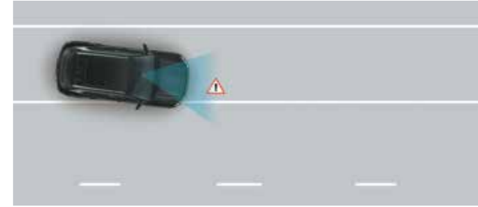
Lane Departure Warning (LDW)