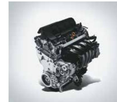
1.5l Petrol [6MT and IVT]