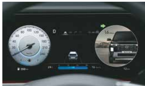
Blind-spot view monitor (BVM)