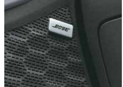
Bose premium sound system (8 speakers)

Other features: USB charger C-Type (Front – 1 and Rear – 2) | Embedded VR commands In-built music streaming application JioSaavn (with 1 year complimentary subscription)