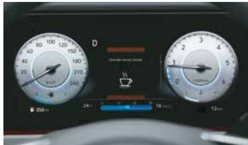
Driver Attention Warning (DAW)

Hyundai CRETA is alive with Hyundai SmartSense-Level 2 ADAS. It assists the driver by deploying advanced safety features thereby making the road safe for the passengers and the pedestrians as well. Now you can look forward in a relaxed manner and devote yourself to the most important thing, the pleasure of driving. And let the advanced driver assistance system be your reliable companion that ensures you master every challenge on the road with confidence.