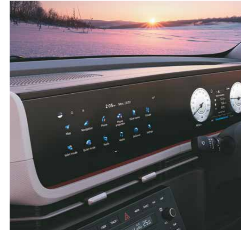
Seamlessly integrated infotainment and cluster screen

Overwhelming presence and discreet glamour. With its symphony of space, Hyundai CRETA is a work of art. In Hyundai CRETA, every journey is a moving moment – even when stationary. Be it the refined cockpit or the comfortable second row, one always has the best seat. The interior is the soul of Hyundai CRETA.