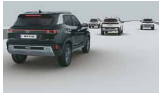
Smart Cruise Control with Stop & Go (SCC with S&G)