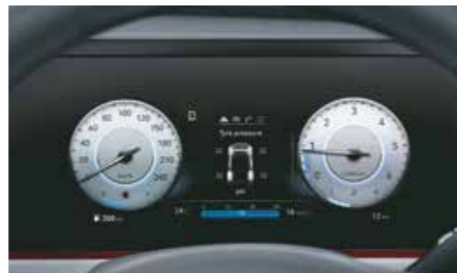
Tyre pressure monitoring system: Highline

Other features: ECM mirror with SOS button | ISOFIX | Front and rear parking sensors