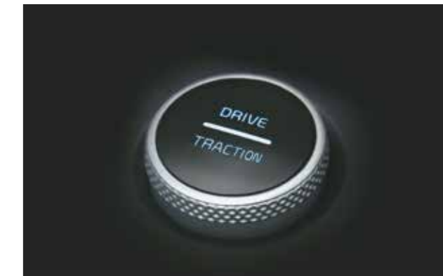
Traction control modes (snow, mud, sand)