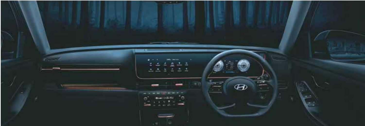
All black interiors with brass coloured inserts.