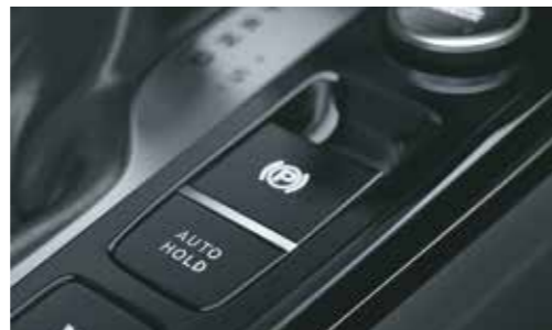
Electric parking brake with auto hold