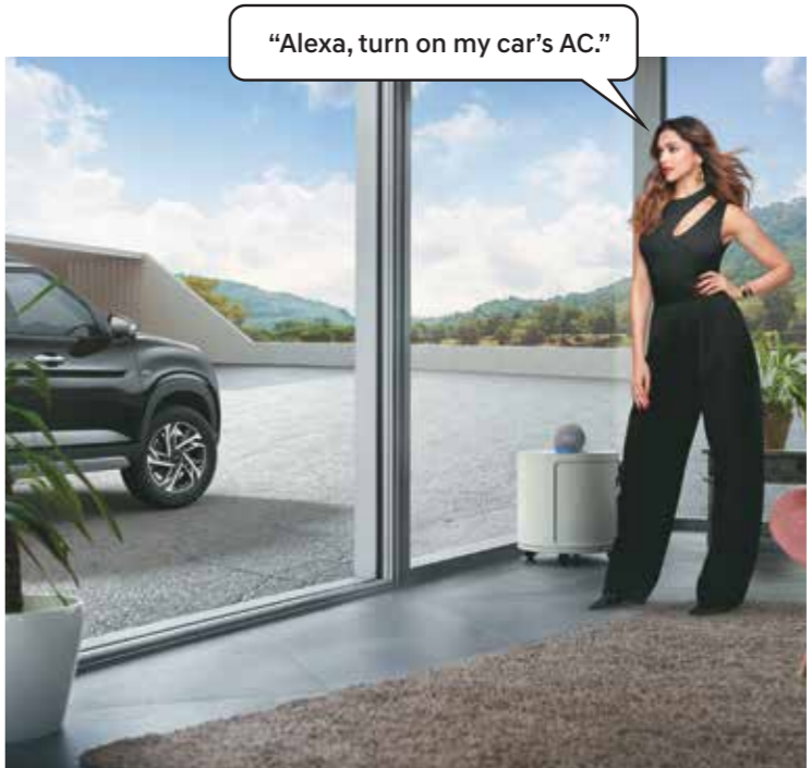
Home to car (H2C) with Alexa

Stand above it all and yet stay completely connected with your world. When it comes to technology, connectivity and infotainment, Hyundai CRETA is equipped with the most advanced features. The innovative Hyundai BlueLink app, Home-to-Car with Alexa gives you the power to control your car from the comfort of your home or office.