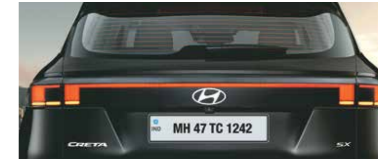
Connecting LED tail lamps